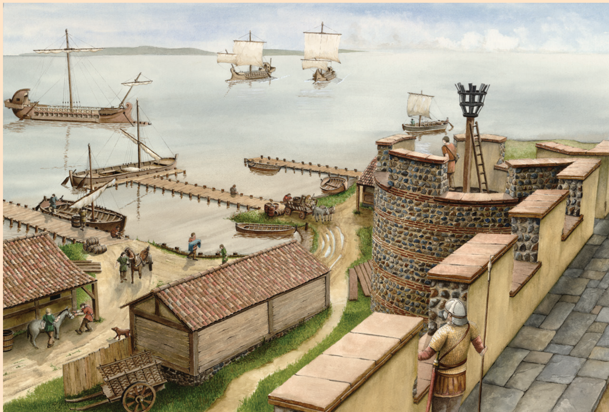
The view from here over the estuary as it might have looked around AD 340, when the sea came right up to the fort.

The position of the fort enabled its garrison to protect trade routes and the Roman towns and settlements upriver and inland. It also provided them with easy maritime access along the coast for supply and communications, to combat raiders, and to take part in major campaigns. In front of you, just beneath the (now vanished) west wall, there is likely to have been a beaching point with facilities for Roman warships and supply vessels.