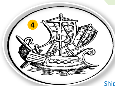
Ship from Roman times