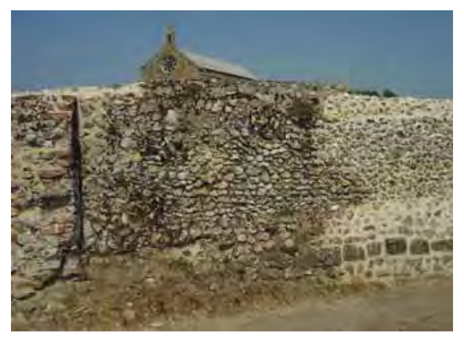
The dead vegetation, including the very rare wall bedstraw, on one of the wildlife reserves the Trust created on the precinct wall at Binham soon after the adjacent pavement had been sprayed with weedkiller.

The picture on the front cover of our 2007/8 Report to Members featured our success in conserving the very rare plant which grew on the medieval precinct wall while at the same time completing repairs to the wall. All went well until the spring of this year when the vegetation on this same section of wall all suddenly died soon after a contractor working for Norfolk County Council's Highways Department was spraying weedkiller on the adjacent pavement. Luckily, Gillian Becket, the botanist who had been advising the Trust on plant conservation while building work was in progress, kept some seed for emergencies and she is hoping to re-establish this plant in its rightful habitat. At the time of writing Norfolk County Council is denying responsibility for what happened.