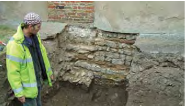
Excavation of the trench against the south wall of Caistor church in progress showing facing flints in the wall which look Roman.

At the same time as excavations were taking place in the amphitheatre field, Will Bowden dug two evaluation trenches in the churchyard to assist the Parochial Church Council in obtaining planning consent for an extension on the south side of the church. The trench close to the church revealed that the lower part of the south wall is built of squared flints which look remarkably similar to those used as facing in the Roman town defences. It is assumed that they are re-used flints, but one can't help wondering if they could represent a Roman building; now there is a thought!