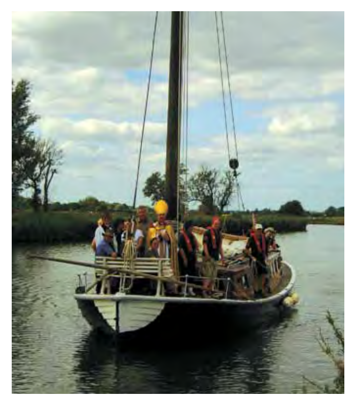
The Bishop of Norwich arrives by the wherry Albion for the 2009 annual service at St Benets, held on the first Sunday in August.

Our next objective is to carry out repairs to the medieval gatehouse, eighteenth-century windmill and other monastic remains as part of a wider project to improve access and public enjoyment to the abbey. The abbey is regarded as one of the iconic sites in Broadland, and as we go to press word has just come through from the Heritage Lottery Fund that our Round One application has been successful! This will give us the funding to work up our proposals in full for a Round Two application by the end of 2010. Not all Round Two applications succeed, but to be awarded a Round One grant for St Benets is another achievement for the Trust to build upon.