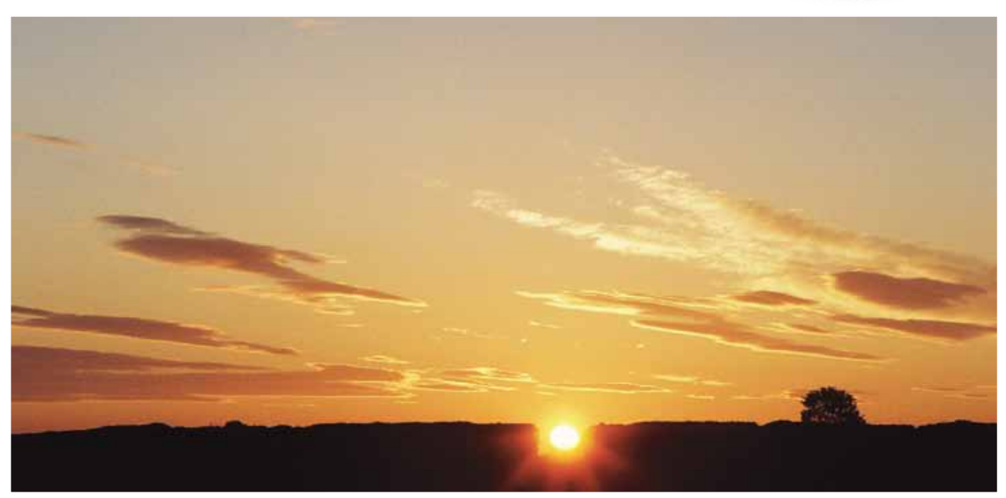
Sunrise through the east gate of the Roman fort at Burgh Castle.