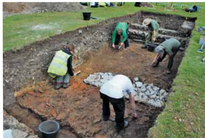
Burnt tile layer beneath the south wing of the forum, cut by later masonry buildings (trench 7).