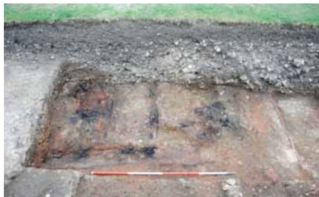
Burnt buildings probably dating to AD 90-140 beneath the north wing of the forum (trench 6).

Perhaps the most surprising evidence came from the street, which proved to be very different from the street excavated in the north-east of the town in 2010. The gravel that made up the street was very shallow (around 0.2 m) compared with other streets in the town which have multiple gravel surfaces making up a depth of more than 1m. In addition, pottery recovered from beneath the street showed that it could not be earlier than the late 2nd century. This clearly demonstrates that not all the street grid was laid down at the same time, forcing us to reconsider our ideas of how the town was founded and how it developed.