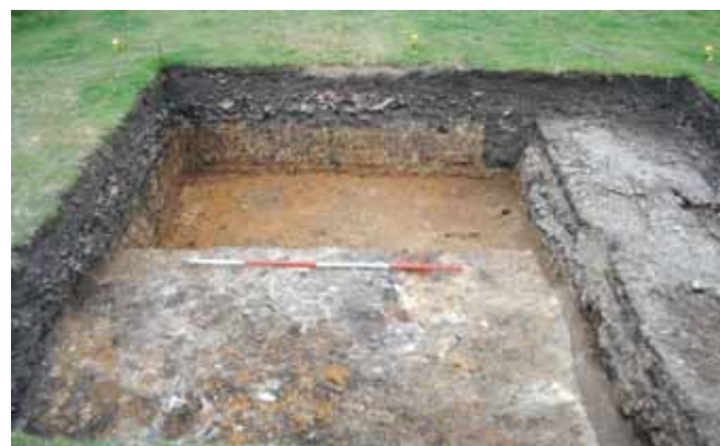
Trench 8 in the basilica showing the wall dividing the nave from the northern room. The floor is supported by dumps of clay derived from earlier buildings (and full of painted wall plaster). The backfill of one of Donald Atkinson's wall-chasing trenches is clearly visible as dark soil in the section next to the wall.